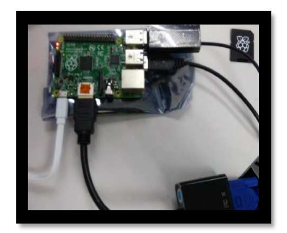
Figure 1: Raspberry Pi Connection with Different Component

The Raspberry pi is a mini computer which is designed in a single board with all the required components required for running an operating system. The board has a micro USB port which uses supply 5V DC. The board can be powered up from the USB port. The provides HDMI port which is used to connect it to the high defination television using an HDMI cable. A video input port is also provided with a Raspberry pi board which is used to connect an external camera. The board can also be connected to the PC using a HDMI to VGA converter. The board contains two USB ports from which one is used to keyboard and other to mouse. There is a local area network to connect a computer network. The board also has a SD card slot. The device using Broadcom controller chip which is an (System on Chip). This controller has all the peripherals like timers, interrupt controller, GPIO, USB, PCM / I2S, DMA controller, I2C master, I2C / SPI slave, SPI0, SPI1, SPI2, PWM, UART0 and UART1. This SOC has the powerful ARM11 processor which runs on 700 MHz at its core. The controller also has a graphical processing unit (GPU) which includes Video Core, MPEG-2 and MPEG-4. It also has a 512 MB SDRAM. The operating systems versions of Windows, Mac and Linux are available which can be installed in the Raspberry pi board.